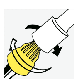
Can also be used with ½ in. or 13 mm nut driver.