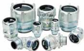
Series 5300-HT Liquidtight High Temp