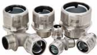
Series 5300SST6HT High Temp