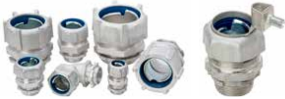
Series 5200AL Liquidtight