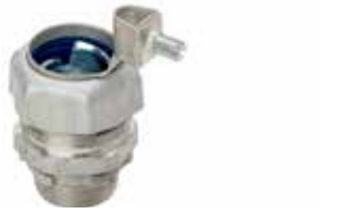
Series 5200ALGR Liquidtight Grounding