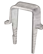
CIS-2 / CIS-4