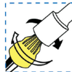
Can also be used with 1/2 in. or 13 mm nut driver.