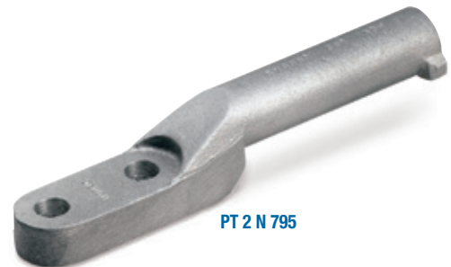
PT 2 N 795