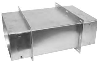
Sold with cover

Designed to pass through walls and fire walls. Hardware included. Note: not fire rated. Fire stop not included.