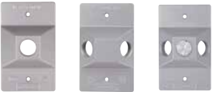
S201E LC-21 S203E-R