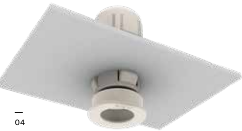
ABB Installation Products Ltd.

Electrification business 700 Thomas Avenue