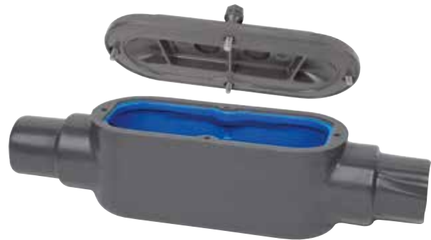
2" C Form 8 conduit body and cover